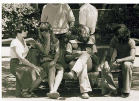
Street Evangelism in Jerusalem in the early years of Jewish Voice